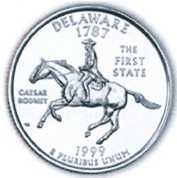
The Delaware quarter's reverse celebrates Caesar Rodney's historic horseback ride in 1776.